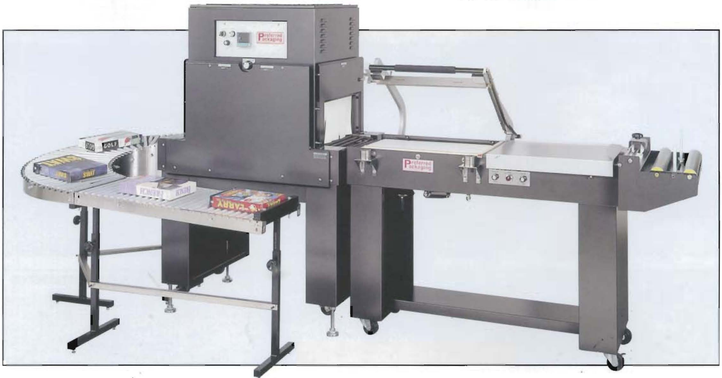
Complete System with Optional 180° Degree Curved Conveyor

*Also Available With 36" Diameter Lazy Susan Product Accumulator.