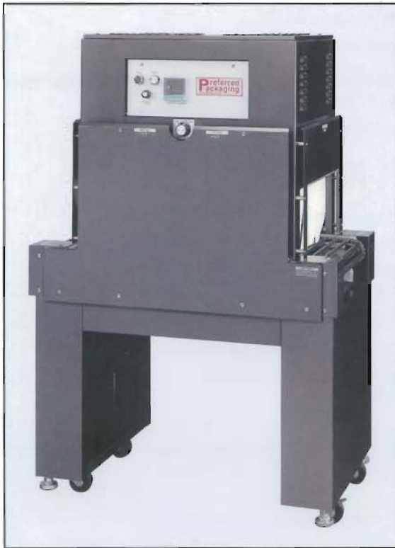
PP1808-28 Shrink Tunnel